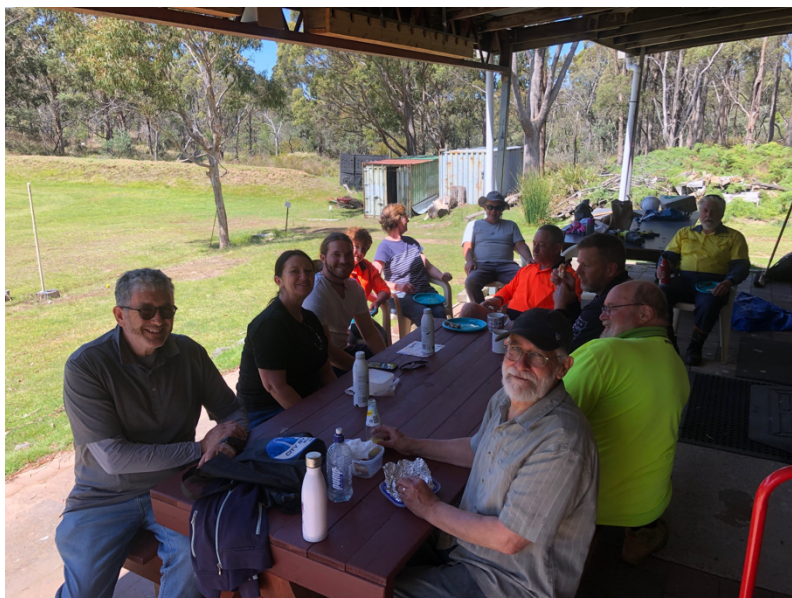
A great turnout for the working bee on Sunday 3 rd November. Great company, good banter, chicken and champagne – well, at least soft drink and coffee!

Thanks to everyone who turned out to the working bee on Sunday 3 rd November. Quite a bit was done, including some cleaning of drains around the clubhouse, pouring the last footings for the gazebos and doing quite a bit of clearing around the field course.