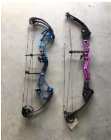
A Mathews single cam bow (right) compared with a conventional 2 wheel compound (PSE) Note also the more parallel limbs on the PSE