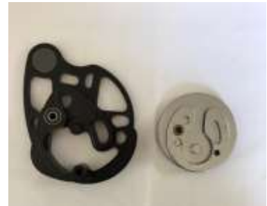
The wheel on the right is from a Pearson compound of around 1990. This shape was considered 'radical' at the time because of the egg-shaped inner cam. Compare that with a later single cam design.

Twin cam bows remained the dominant model though. One thing that helped with the cam timing on two-wheel bows was the introduction of stronger string materials in the early 1990s. Up until this stage, cables on bows were made of steel and were of fixed lengths. They did work but needed to be accurately set up from the outset and were difficult, if not impossible to adjust. Using string materials for cables meant that twists could be added or taken away to help with cam timing. They were also somewhat safer, as steel cables held the string in place with 'teardrop' or hook shaped ends. These were not fun if they decided to break at full draw or when drawing back!