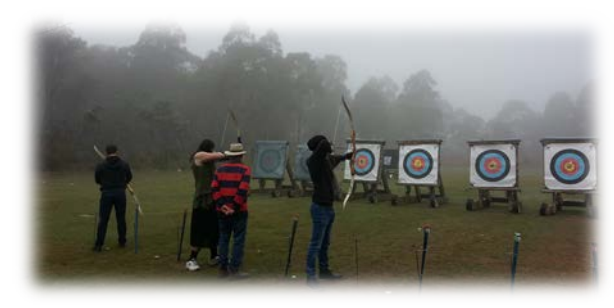
One group showing determination in the fog.

7 groups for this month, for a total of 56 participants. The groups were the Launceston Christian School, Anglicare and a number of children's birthday parties.