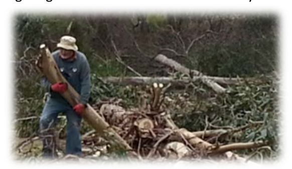
A handy fellow to have around. As I'm sure mother would agree!

While clearing the tree foliage we had a rare sighting of the "red handed" Tasmanian yowie.