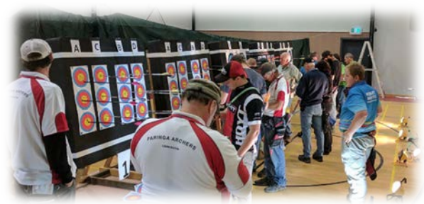
A mix of long term and newer members had a good time with some Burnie and Hobart archers.

The Paringa Northern Indoors was held at Cressy High School hall on the 27-28<sup>th</sup> May 10`7.