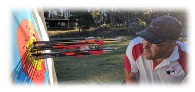
Not a bad grouping