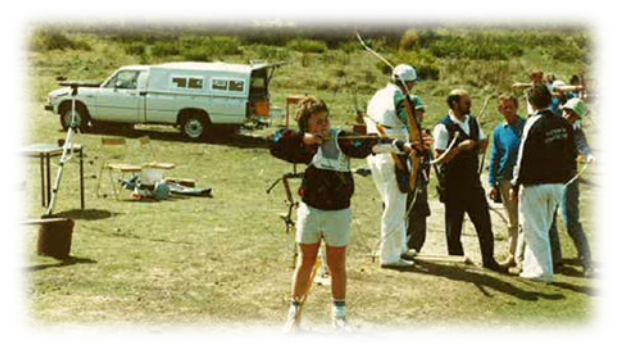
Young fellow (?) keen while the oldies (?) discuss the finer points. Not much changes. ☺