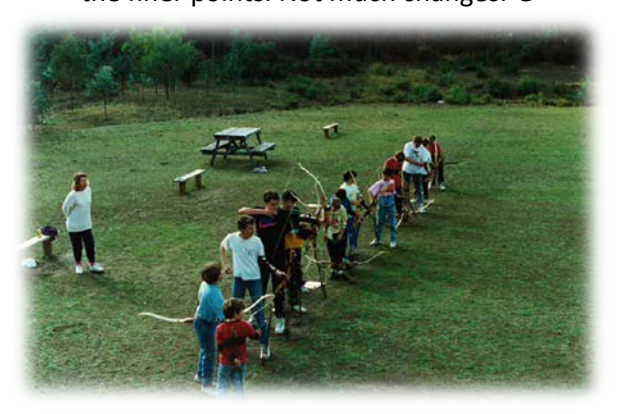
And it was at one time, green!

Don't forget the World Masters Games in NZ 2017 at http://www.worldmastersgames2017.co.nz