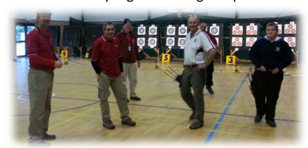
The Judges making sure all is in order