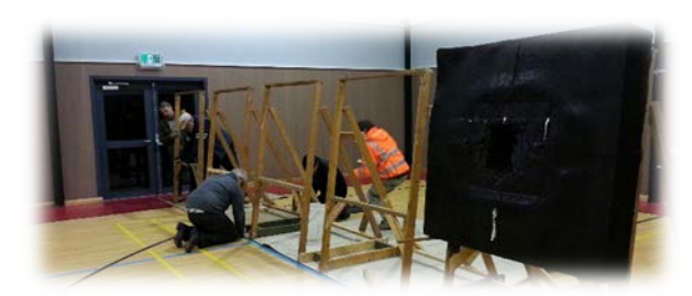
Thanks to the members that helped with the setup/takedown on the weekend.