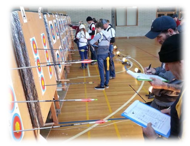
The final end of two days competition

Thanks to those members who helped transport, setup and remove the butts and frames for the event and of course the Judges who did an excellent job.