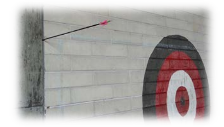
Sometimes arrows just won't hit the target