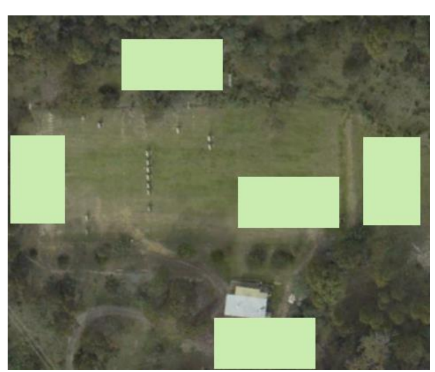
Five possible locations for a 12m(W) \times 30m(L) \times 3m (Wall H) shed. (Not to scale)

Kit sheds with 2 roller door and gabled roof have been quoted from $25k - $35k + $25k for piers and assembly. No power or floor.