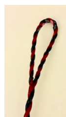
Flemish twist string -note the twisting throughout the loop

When making strings, a good string maker will always pre-stretch a completed string to take out any creep in materials and to help 'lock in' the loops. With use of modern materials, bowstring stretch should be almost non-existent when placed on a bow, but it always pays to check your brace height after several shots. Flemish twist strings are more prone to stretch but when settled in should be very stable.