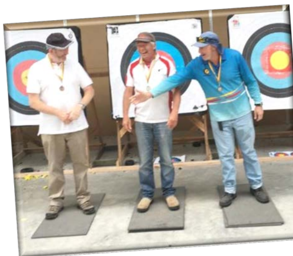
Obviously don't know how to do it!