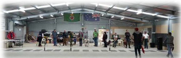
Waiting for the next end.

The Northern Indoors was held the weekend of May 26 th and 27 th . Well attended by other clubs and a great test for the Indoor range.