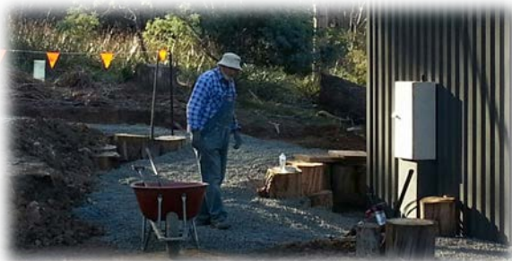
Barry P (a human 3 tonne excavator) makes another 3m of blue metal gravel disappear in the path and Indoor surrounds.