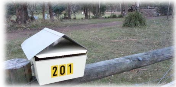
New A4 letterbox ready for mail.

A little bit more done on lining the Indoors and putting up some of the advertising.