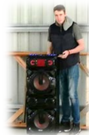
Of course, every good working bee needs a DJ to keep us "rocking" or was the "head banging"

Next Working Bee: See calendar Organiser: All members