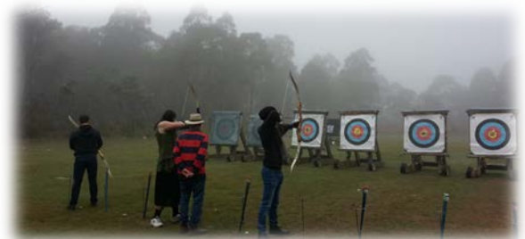
One group showing determination in the fog.

7 groups for this month, for a total of 56 participants. The groups were the Launceston Christian School, Anglicare and a number of children's birthday parties.