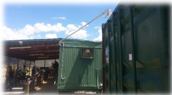
Power from the club house to containers at Hobart Archers.