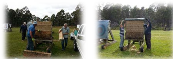
Stramit target repair Wed 6 th Dec.

"We make a living by what we get but we make a life by what we give." Winston Churchill