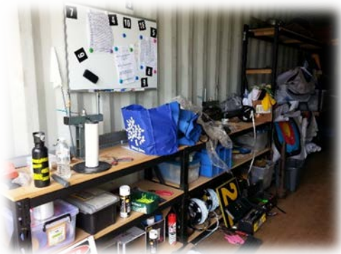
Burnie Bowmen's Archers Workshop

Target and Field: 201 Reatta Rd, Trevallyn Reserve, Launceston, Tasmania