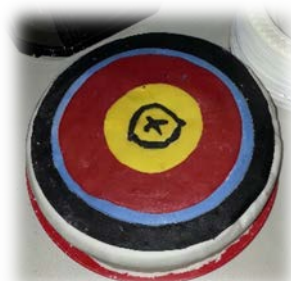
A couple of the many different items for dessert.

Once again, a big thankyou to Brian S for doing the BBQ and getting all the utensils.