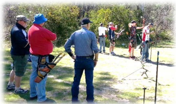
Start of the Target QRE Sat 19/11/2017