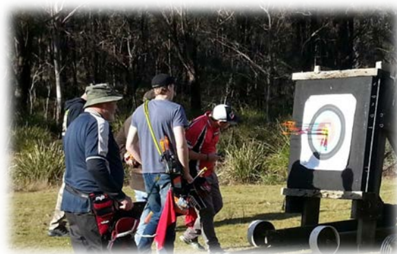
Launceston round 15/7/2017.