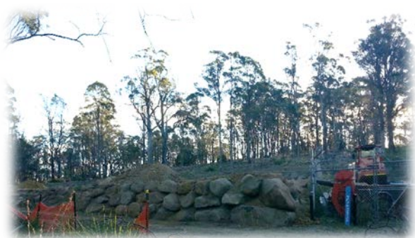
Preparation for the Rangers new shed, as seen from the road.