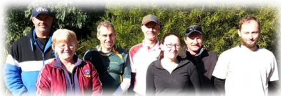
The Burnie contingent

Northern Indoors was held 23-24 th May 2015 with a good turnout from Burnie and Hobart archers.