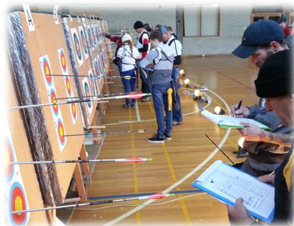
The final end of two days competition

Thanks to those members who helped transport, setup and remove the butts and frames for the event and of course the Judges who did an excellent job.