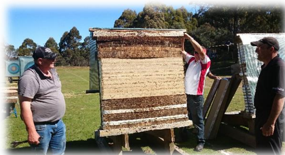
Replacing the stramit to prevent shoot throughs.