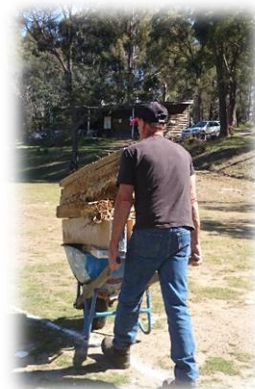
Widening the target butts to allow multiple target faces for QRE events.