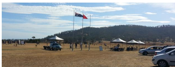
Hobart practicing for the Open (2/2/2014)

If you're not having a go then it's the great opportunity to go to Hobart to see some of the best archers in Australia.