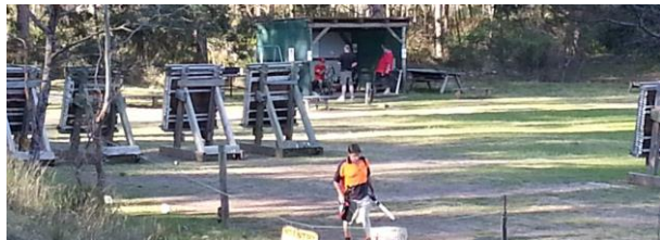
The weekend before Christmas and still they come! (18/12/13)

To help make the newsletter relevant for you, please pass on any comments, suggestions or submissions to the email in the footer or catch me at the club.